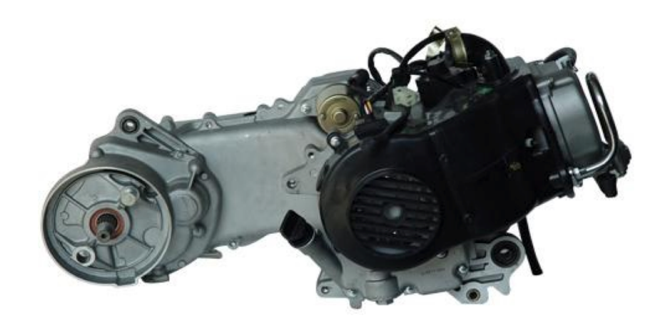
Figure 1: GY6 Engine